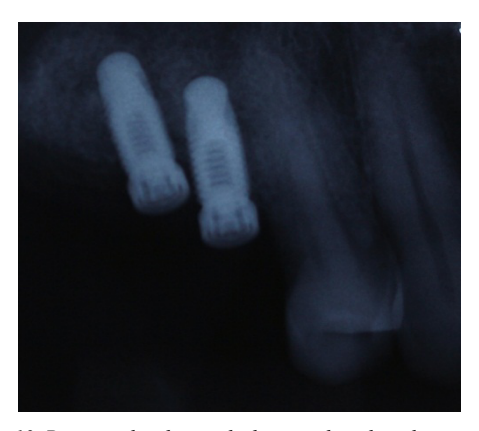
Figure 10. Periapical radiograph showing dental implants in place.