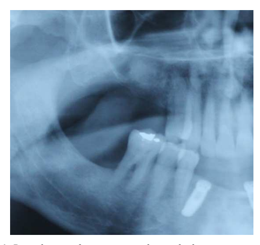
Figure 6. Partial view of panoramic radiograph showing proper filling of the maxillary sinus. As can be seen, the amount of material placed in the sinus was neither excessive nor insufficient.