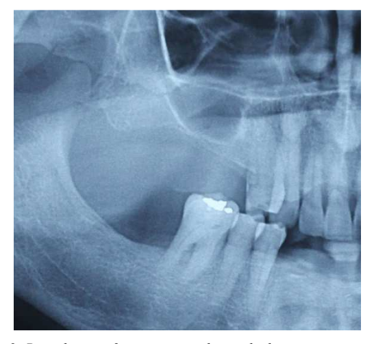
Figure 2. Partial view of panoramic radiograph showing missing teeth 15 and 16, and bone height of 1 mm as far as the maxillary sinus floor.

The proposed treatment plan consisted of bone graft using Lumina-Porous<sup>®</sup> biomaterial (Critéria, São Carlos/SP) and subsequent placement of dental implants.